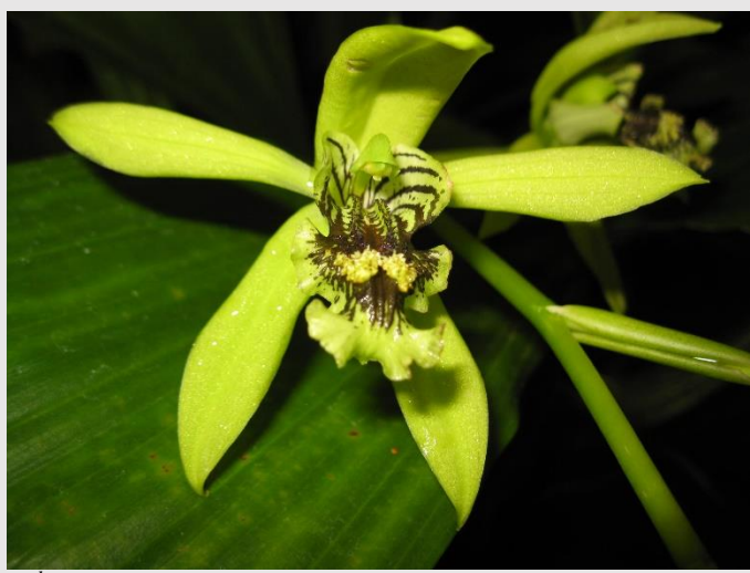
3 rd Place / Best Species