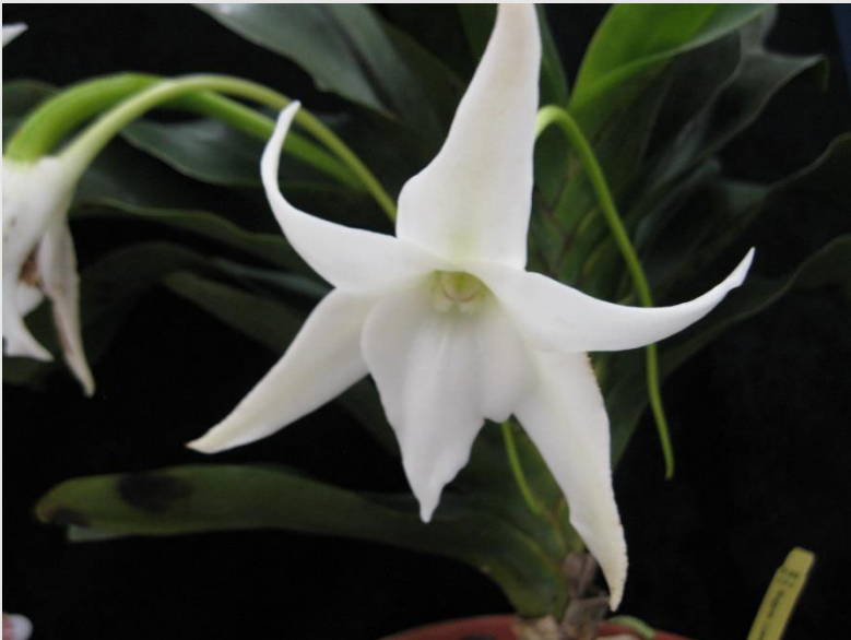
2 nd Place