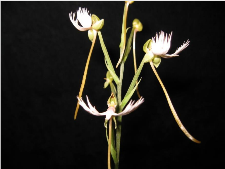
Members' Choice / Speaker's Choice