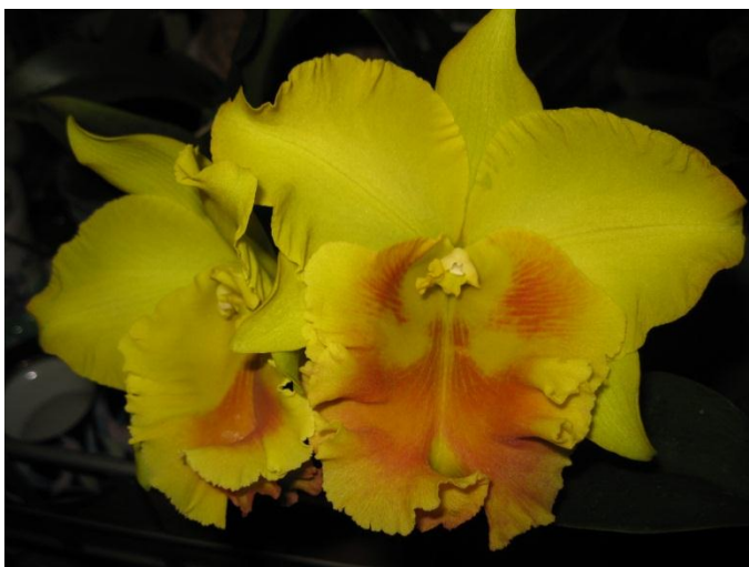
Rlc. Haadyai Delight 'Bangprom Gold'.