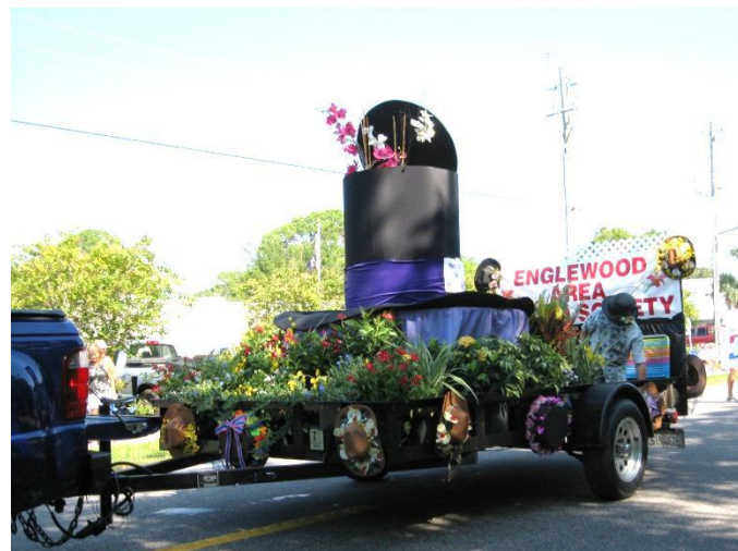
EAOS float joins parade for Pioneer Day in Englewood.