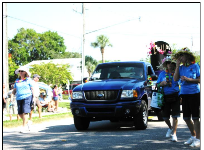
The Sept 3, Pioneer Day Parade gave EAOS a chance to let the community know about us.