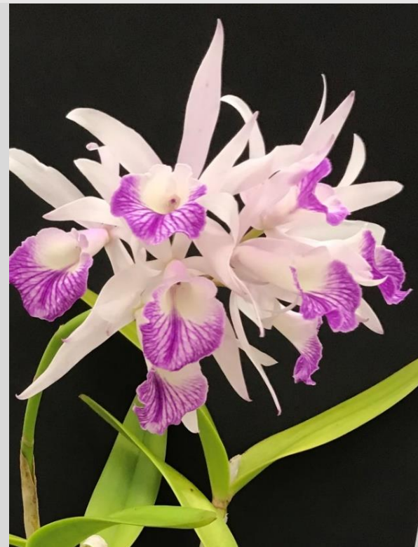
2 nd Place