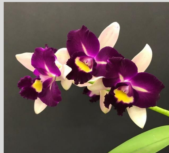
1 st Place & Members' Choice