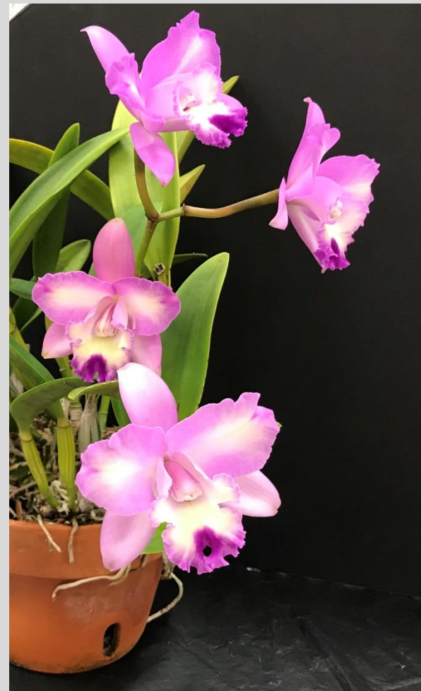
3 rd Place