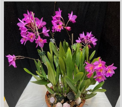
3 rd Place: unknown – Debra Remic