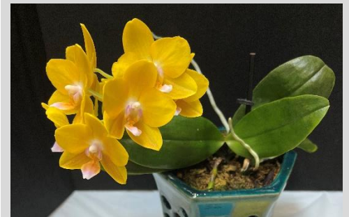
3 rd Place: Phal Liolin Lawrence – Lynne Kastal