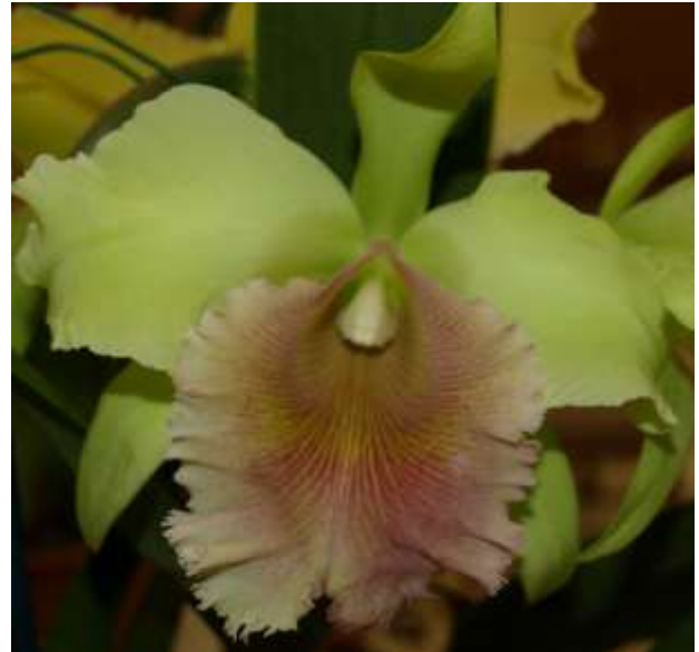
Roy Klinger took the top spot on the plant table with Blc. Ojai ‘Verde.’