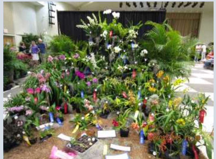
EAOS display at the Venice show won 3 rd place award.