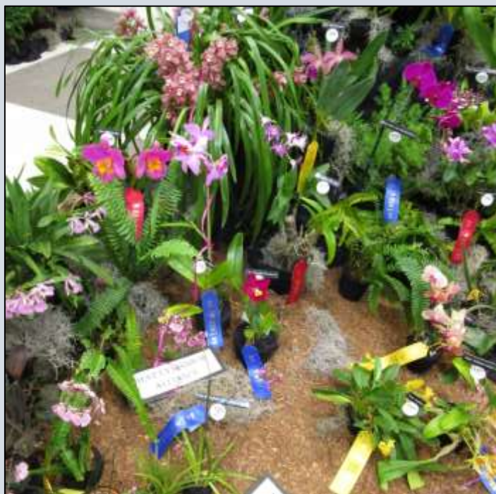
Cym. Mimi, top, was awarded the Best Cymbidium prize at the Venice show.

I need everyone's help in this. Do you use Facebook, Instagram, Twitter, Pinterest, Google+, or another social media site? If you do, you can help advertise our show. Copy the flyer on p. 2 and post it to your social media site. If you post it a couple of times from March 1-5, that would be great. The more people that know about our show, the more people will come and it will be a success for our vendors and for the society.