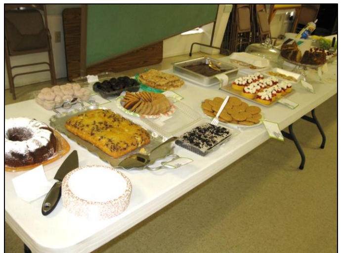
The annual picnic meeting featured desserts by members.

The EAOS Newsletter is published by the Englewood Area Orchid Society, P.O. Box 257, Englewood, FL 34295: