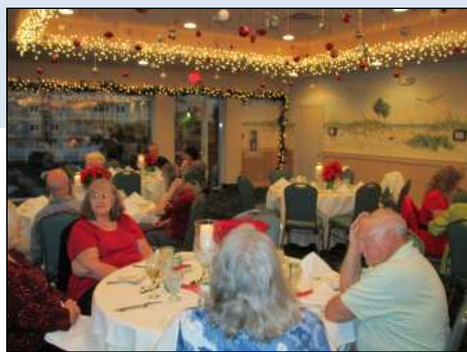
The holiday dinner meeting held at the Gulf View Grill featured sparkling decorations and excellent food as well as a chance for members to win orchids in the raffle.