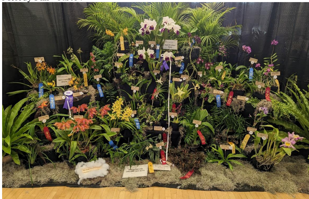
The EAOS display at the Sarasota show.