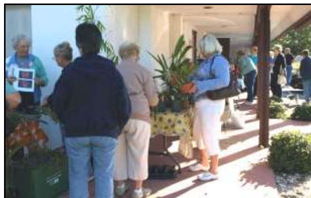
Crowds inspect orchids at the annual plant sale on Christ Lutheran Church on Dec. 5 th .