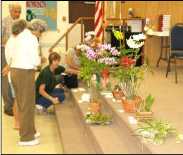
Members vote for the members' Choice award.