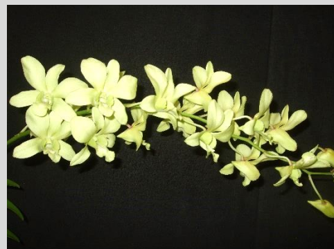
3 rd place - Den. hybrid Candy Bott